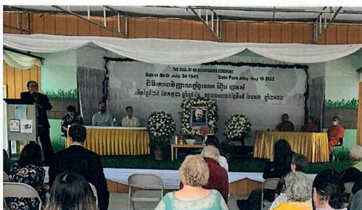
Memorial service gathering at the Cambodian Buddhist Temple in Madison, June 2022.